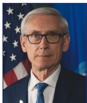
Governor Tony Evers (D)

115 East • State Capitol • Madison, WI 53702